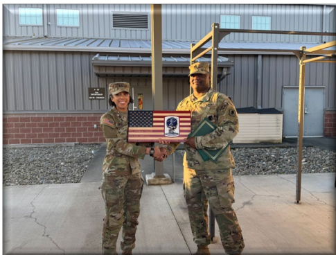
Plaque for SFC Troupe