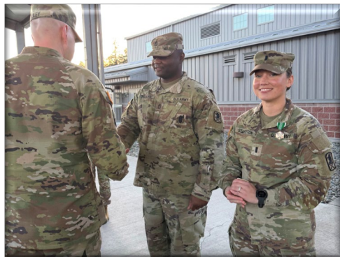
Coined by BC