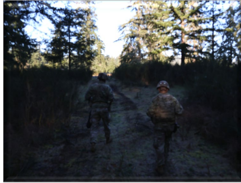
CSM field walk