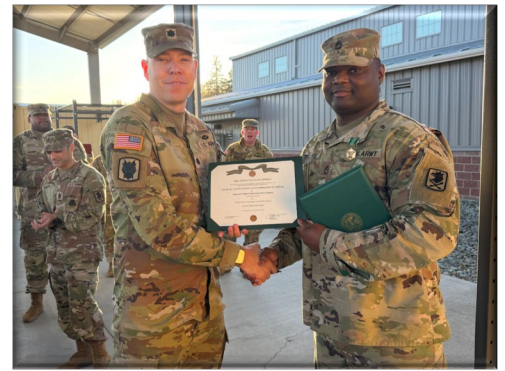
PCS award for SFC Troupe