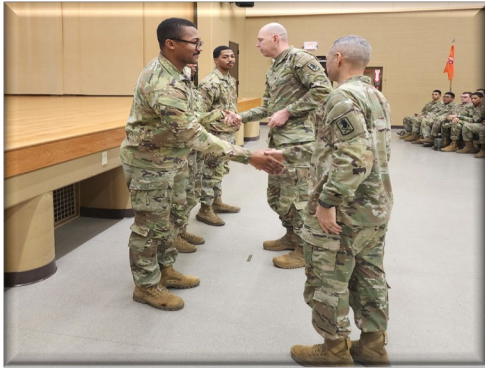
BN Coin Presentation