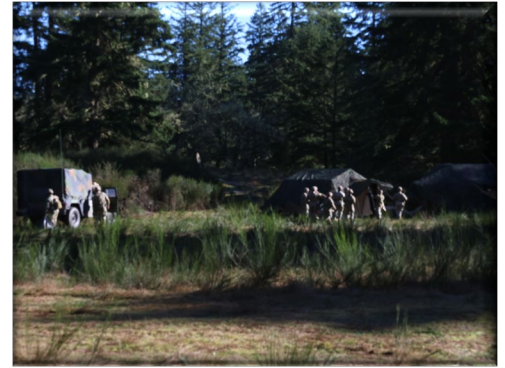
Tent set up