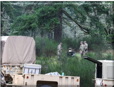
SNN Set up