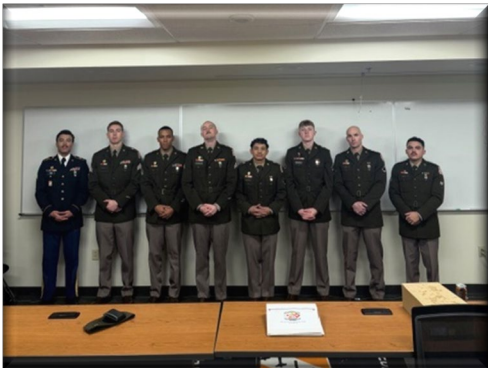
NCO/Soldier of the Quarter Board