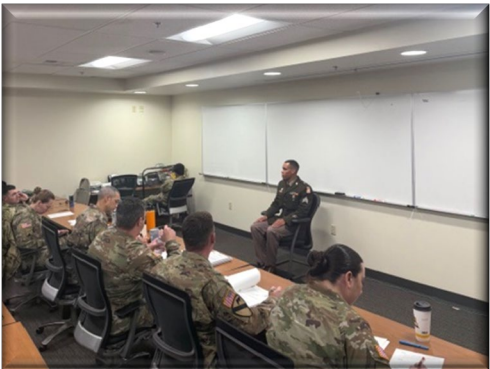
NCO/Soldier of the Quarter Board