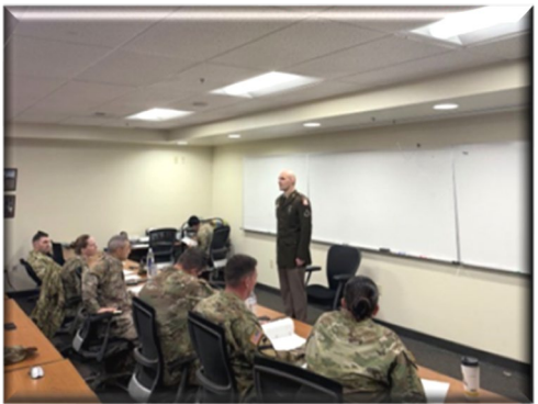
NCO/Soldier of the Quarter Board