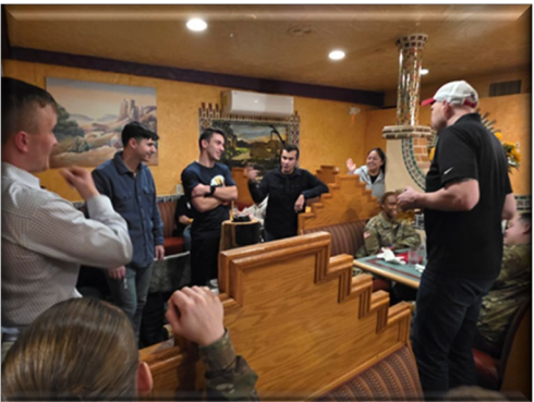
Hail and Farewell