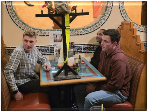
Hail and Farewell