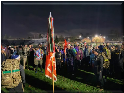
51 st Santa Ruck