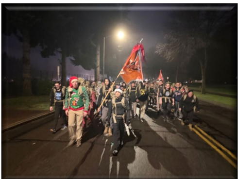
51s ESB-E Santa Ruck