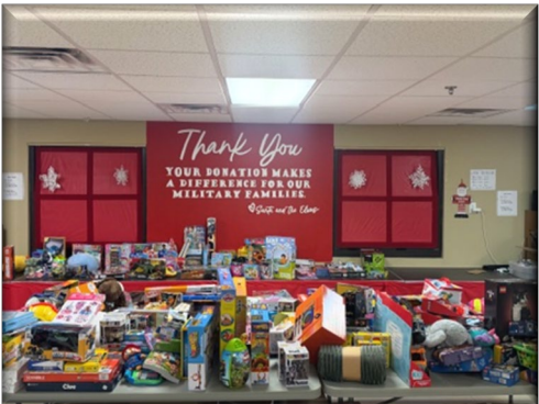
51 st ESB-E Santa Donations