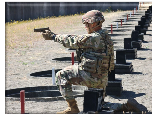
CSM at the M17 Range