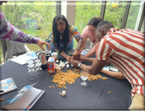
51 st ESB-E BSRT Event