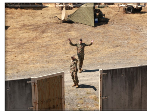
BN CMD Team visits C Co during their FTX