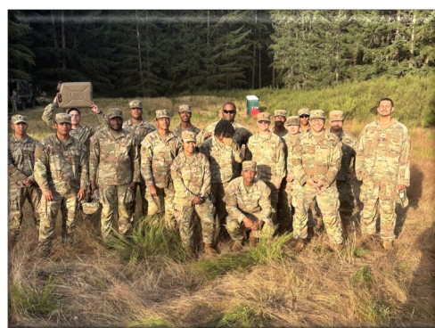
A Co takes a group photo after their FTX