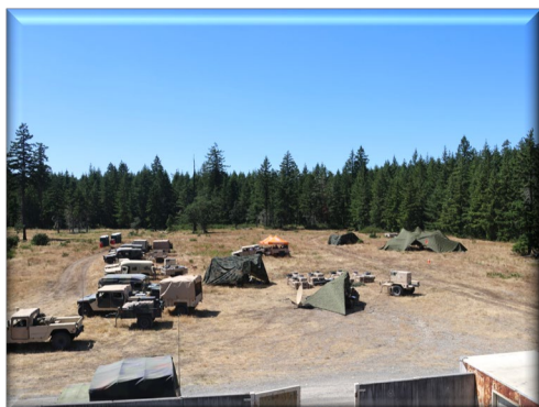
C Co FTX Site