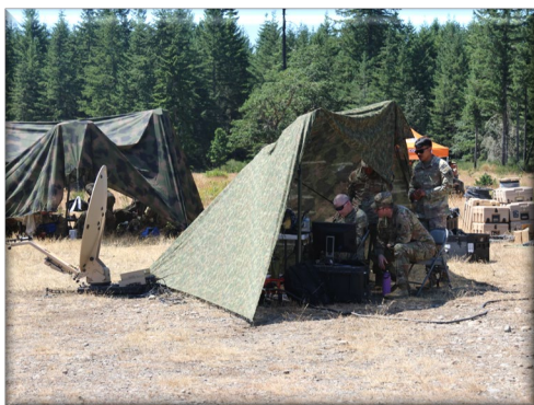
NETOPS providing support during C Co FTX