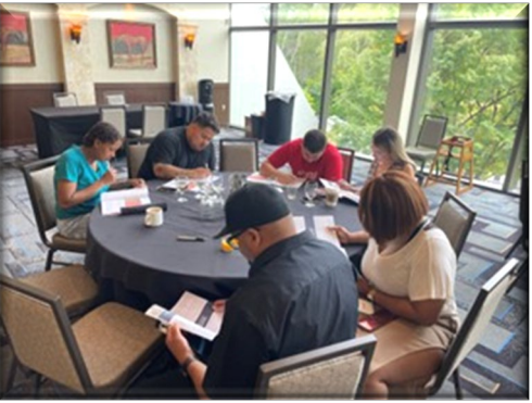
51 st ESB-E BSRT Event