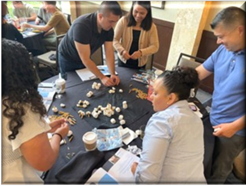
51 st ESB-E BSRT Event