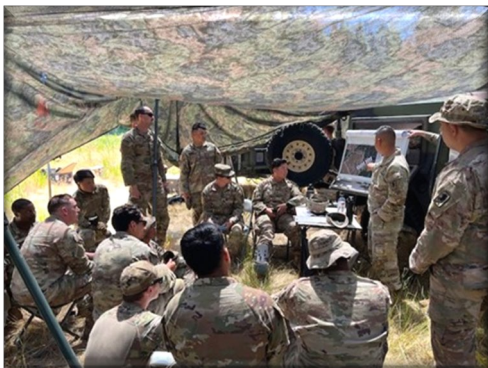
C Co conducting briefs during their FTX