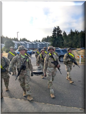
B Co Litter Carry PT