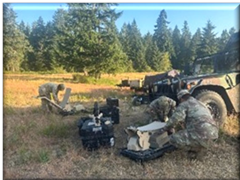
PFC Mosby, PFC Pierce, PFC Teeter at A Co's FTX