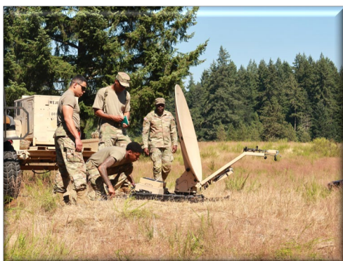
A Co troubleshooting Hawkeye