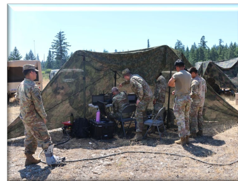
NETOPS providing support during C Co FTX