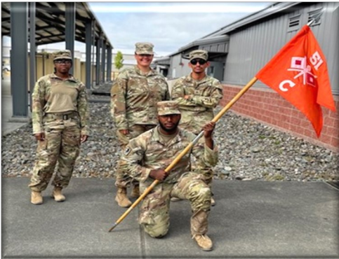
Team 460 from C Co, validated their SNN in 22 min and 13 secs