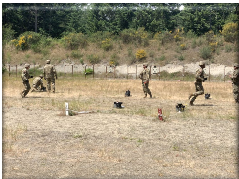
I Corps Best Squad Competition