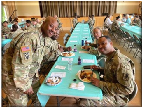
51 st ESB-E Spiritual Luncheon