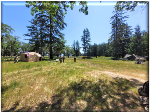
B Co FTX