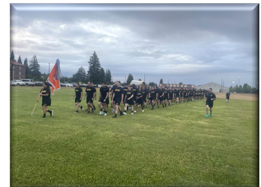
I Corps Run