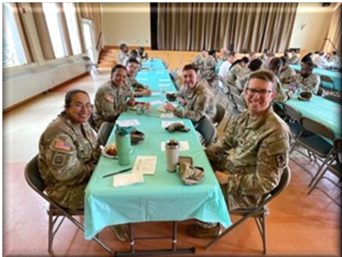
51 st ESB-E Spiritual Luncheon