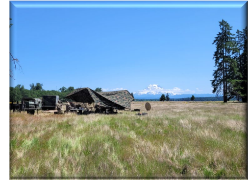
B Co FTX