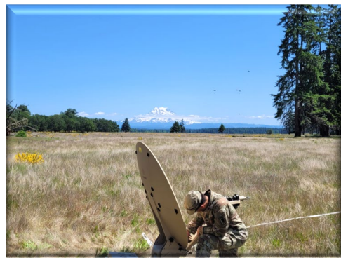
B Co FTX, SGT Chism with Hawkeye