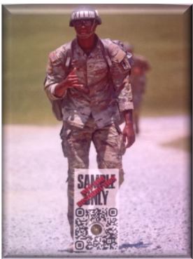
CPL Day at Airborne School