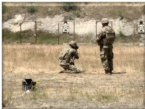
I Corps Best Squad Competition