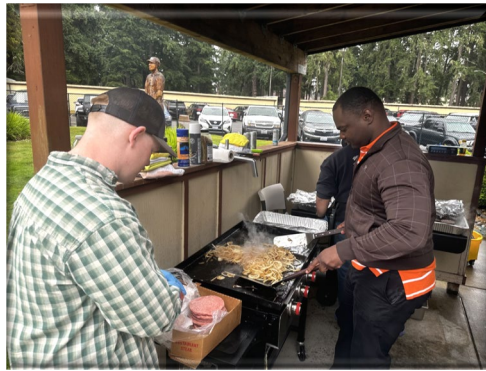
51 st Volunteers at the Veterans Golf Scramble