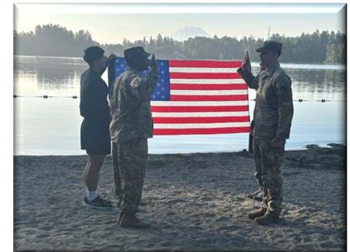
Congratulations to SPC Beat on an awesome re-enlistment!