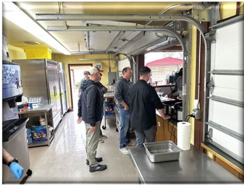
51 st Volunteers at the Veterans Golf Scramble