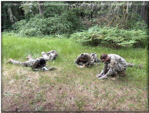
Atlas conducting Land Navigation