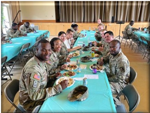
51 st ESB-E Spiritual Luncheon