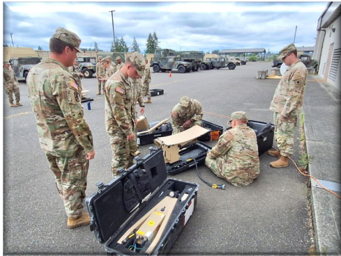
B Co 2nd PLT Cross Training with SISCO