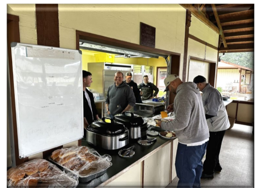
51 st Volunteers at the Veterans Golf Scramble