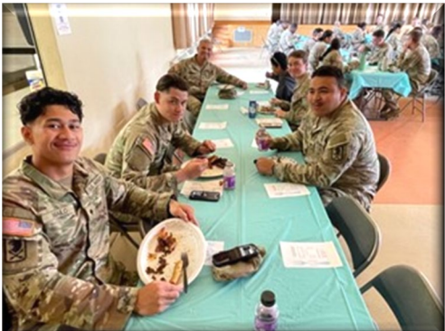
51 st ESB-E Spiritual Luncheon