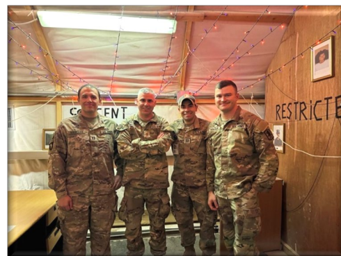
S3 dominates in new BN SHARP Escape Room