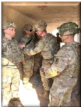
Cobras awarding SSI MOHC during a bunker drill