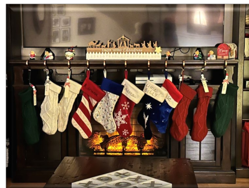
Atkinson's getting ready for Christmas