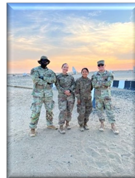
Cobra PLT leadership after a successful range