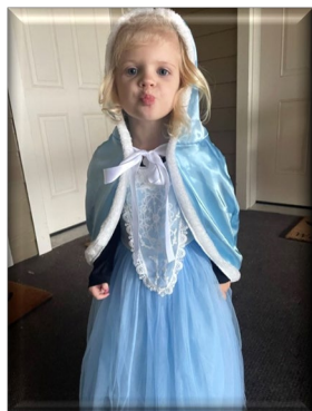
SGT Coope's daughter dressing up as Cinderella