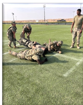
Cobras training at Camp Buehring