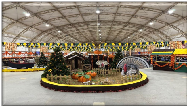
Thanksgiving at the Feed Tent at Camp Buehring