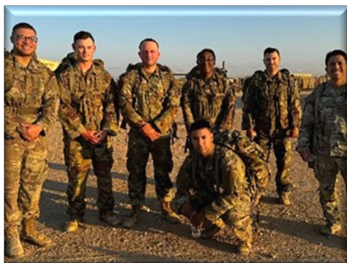
Bruins preparing for the Best Squad Competition, schedule for December