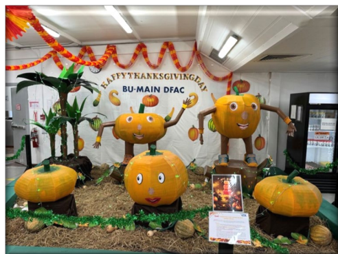
Thanksgiving at Camp Buehring Main DFAC