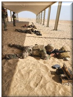
Soldiers firing at the M4 range