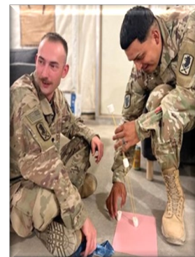
Bruins conducting Forging Iron Training