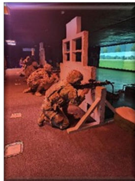
Soldiers at the EST, preparing for the range