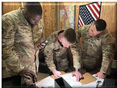
C Co completes the new BN SHARP Escape room