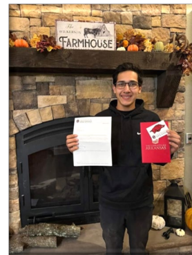
SPC Lay's younger brother accepted to Arkansa