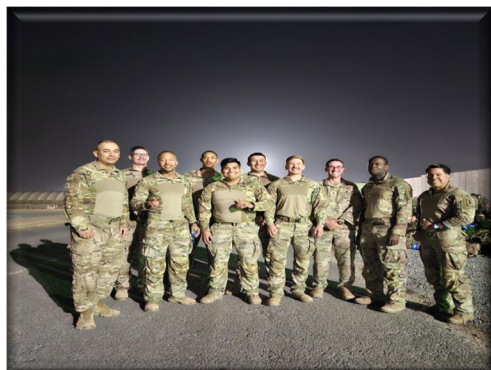
HHC, 51st Norwegian Ruck team!!