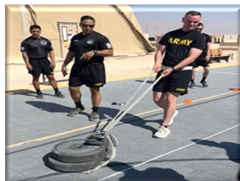
Bruin NCOs reviewing ACFT grading criteria