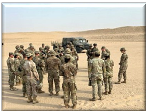
Cobras preparing to start the M4 range near Camp Buehring