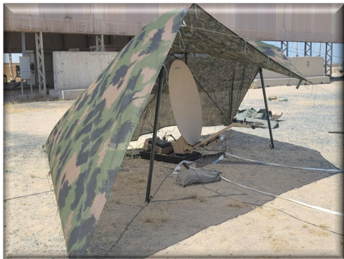
Cobras protecting Equipment