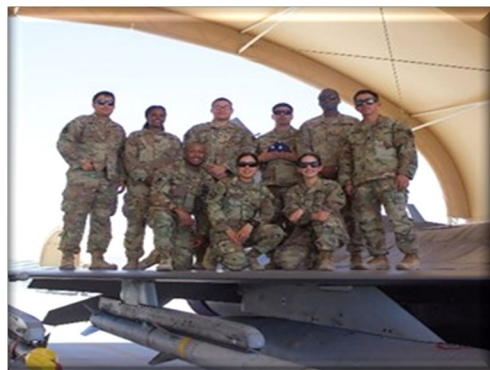
Bruins reenlist on F16 Fighter Jet