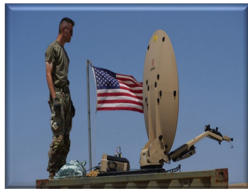
Atlas Validating Equipment