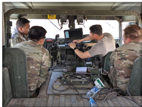
C&E at work