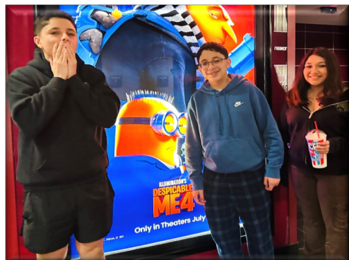
Atkinson's at the Movies