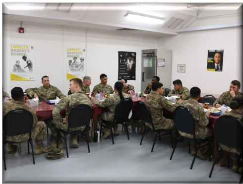
Lunch with 22d CSB CMD Team