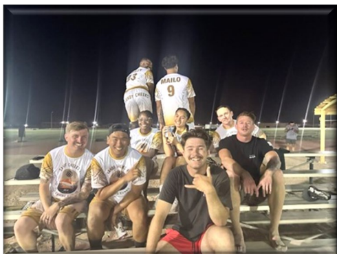
Cobra undefeated in the ASG Kuwait Volleyball Tournament