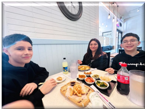
Atkinson's Experiencing the Korean Cultural