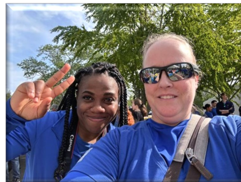
JBLM Wear Blue 5k