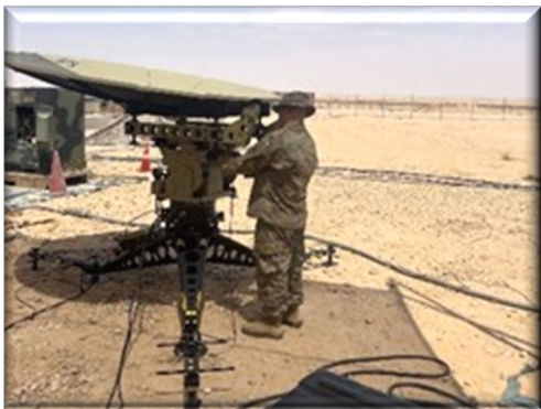
Bruins deploy Phoenix-E