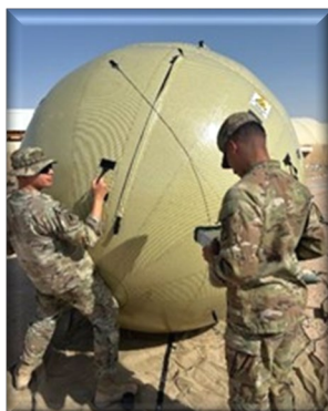
Cobras validating equipment