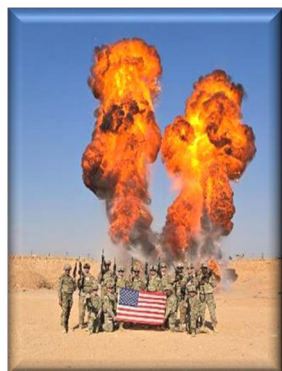
Atlas with EOD