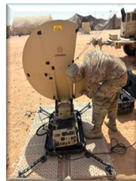
BCO continues to maximize on training and validations