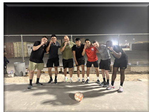
51st wins indoor soccer championship