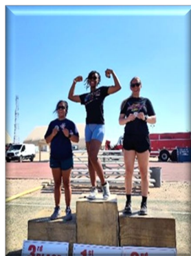
Cobra LTs won 2 nd & 3 rd in Firefighter Challenge