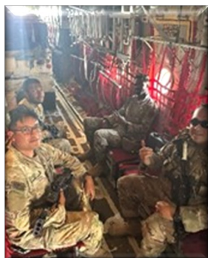
Cobras off to another mission