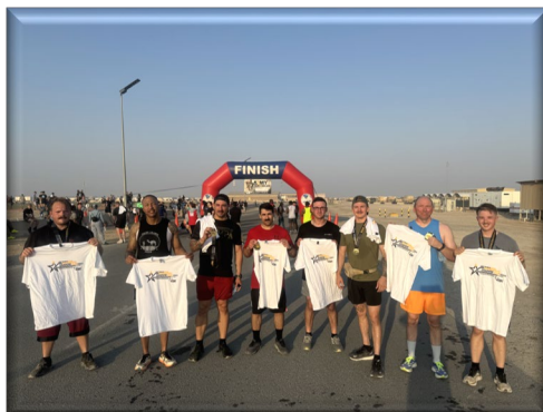
HHC participate in Camp Buehring ATM