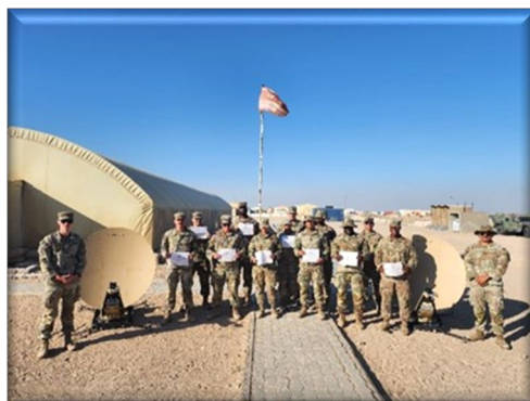
Cobra's graduate second SNN Academy at Camp Buehring