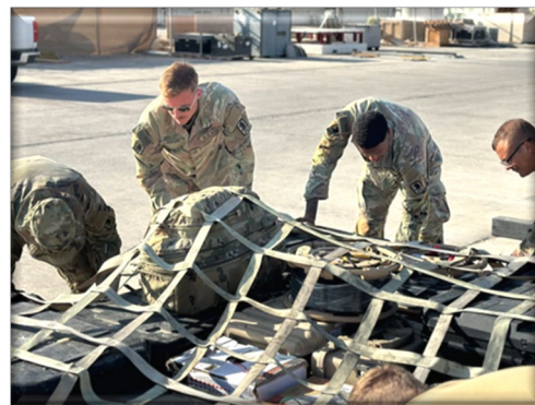
Atlas preparing for another mission