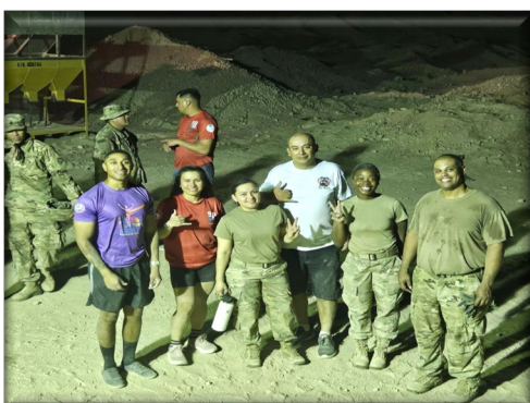
HHC Soldiers helping with base defense by filling sandbags