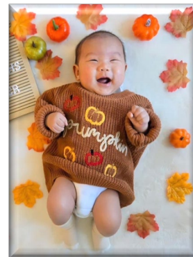
Congrats to SFC Sidd, cousins welcoming their new boy