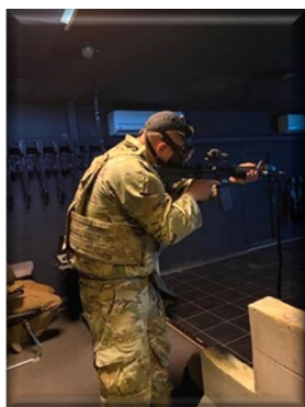
Cobras run EST