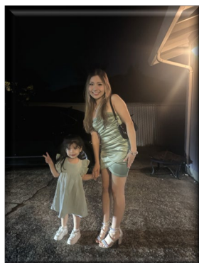
SSG Marins oldest daughter's Homecoming Dance