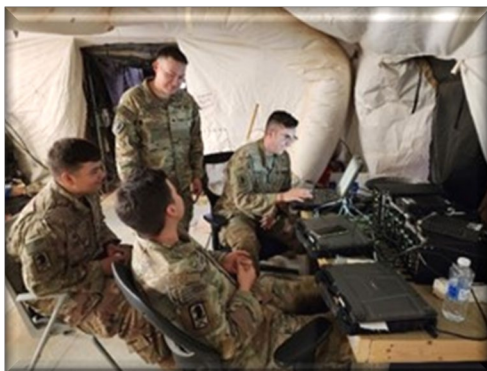
BCO Tech Team and operators conducted T2C2 system updates