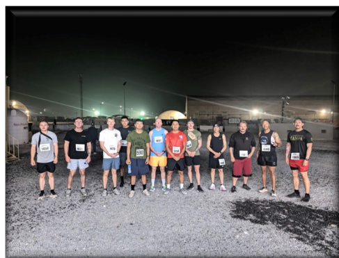
51 st ESB-E participates and wins the Camp Buehring Army Ten Miler