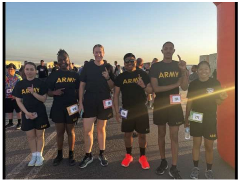
S1 representing at memorial 5k