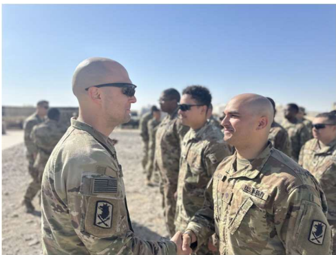
Apollo's patching ceremony