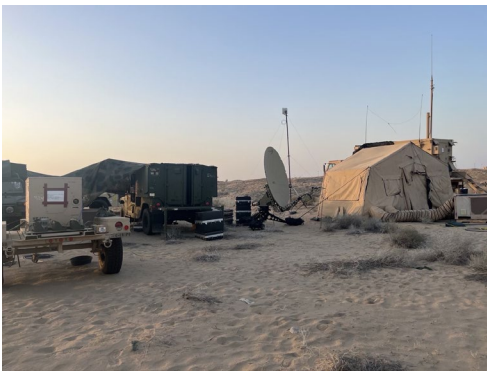
Cobras at work