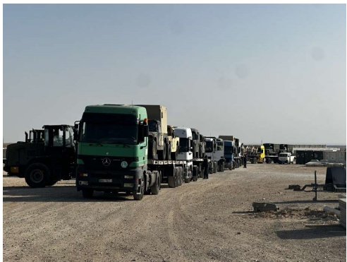
Apollo's rolling stock arrives