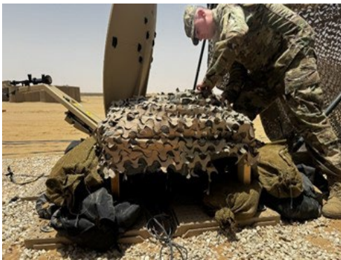
Innovated thinking by the Bruins