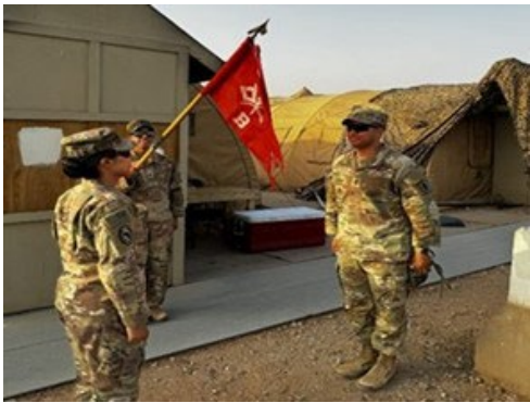
Bruins uncase their Guidon