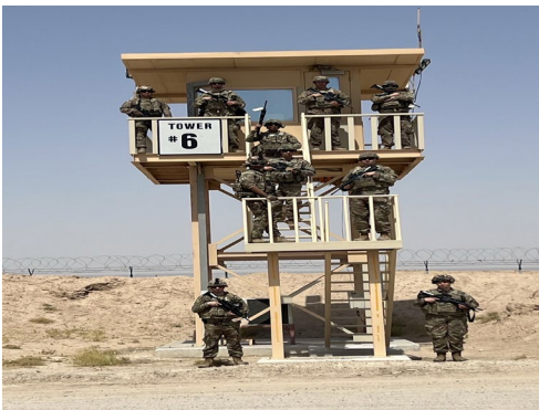
Cobras and Highlanders on Tower

HHC Co Mailing Address RANK LAST NAME, FIRST NAME HHC, 51st ESB-E APO, AE 09330