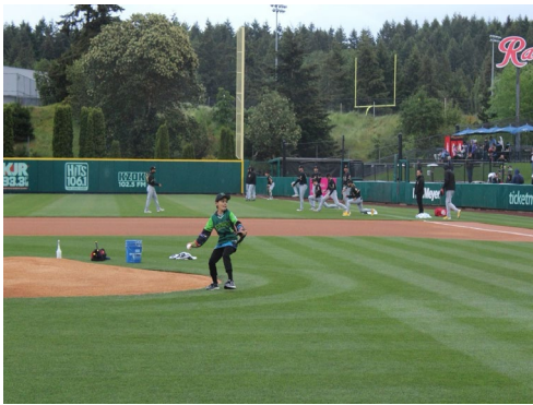
Thornburg Family Highlight